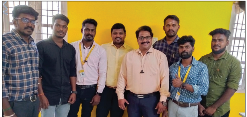
Svasti Microfinance Ponneri (Tamil Nadu) Branch opening ceremony, on 21st February 2022.