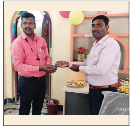
Svasti Microfinance Arakkonam (Tamil Nadu) Branch opening ceremony, 30th March 2022.