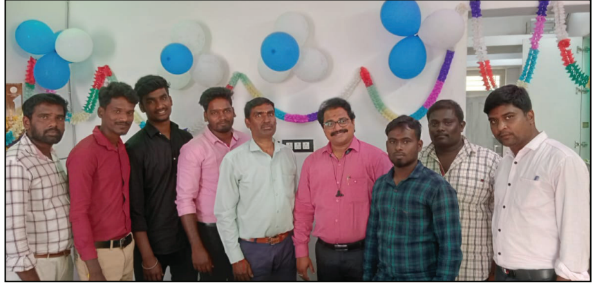
Svasti Microfinance Sholinghur (Tamil Nadu) Branch opening ceremony, on 10th March 2022.