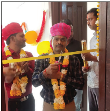
Svasti Microfinance Kuchaman City (Rajasthan) Branch opening ceremony, on 4th March 2022.

“I joined Svasti in January 2020 as an Officer in the IT Department. I have been with the organization for more than 2 years now, and have been able to transform myself as a professional in more than one way.