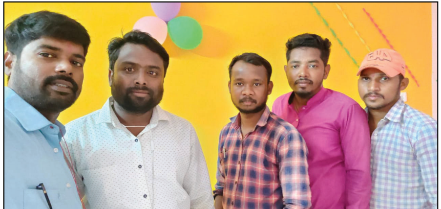
Svasti Microfinance Kanker (Chhattisgarh) Branch opening ceremony, on 10th March 2022.