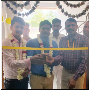
Svasti Microfinance Ajmer (Rajasthan) Branch opening ceremony, on 23rd February 2022.

We are happy to share with you, some photos from various Svasti Microfinance branch opening ceremonies in the three months past.