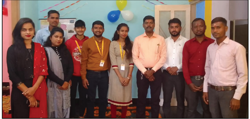
Svasti Microfinance Rajnandgaon (Chhattisgarh) Branch opening ceremony, on 28th January 2022.