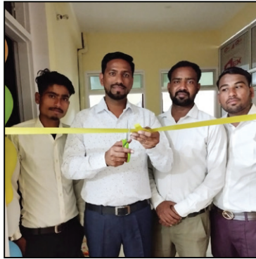
Svasti Microfinance Sawai Madhopur (Rajasthan) Branch opening ceremony, on 21st February 2022.