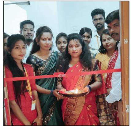
Svasti Microfinance Dhamtari (Chhattisgarh) Branch opening ceremony, on 21st February 2022.